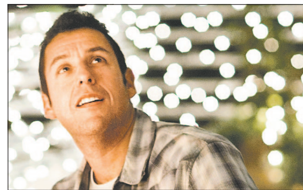
Adam Sandler takes his shot at making a family film with "Bedtime Stories" but misses the target.